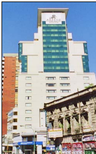
Abasto Plaza Hotel